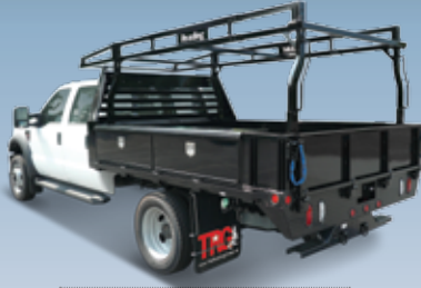
Steel Contractor Bodies