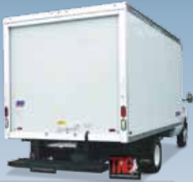
Cut-Away Van Bodies