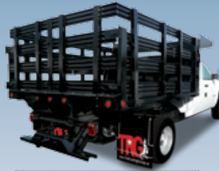
Steel Stake and Platform Bodies