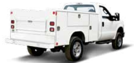
Steel Service Bodies