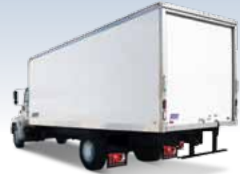
Dry Freight Van Bodies