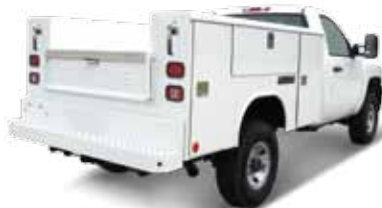
Aluminum Service Bodies