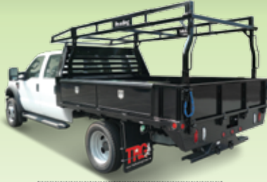
Steel Contractor Bodies