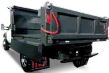
Drop Side Dump Bodies