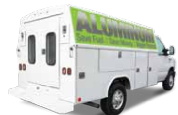
Service Vans 57" and 75" single and dual wheel