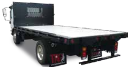
Composite Platform Bodies