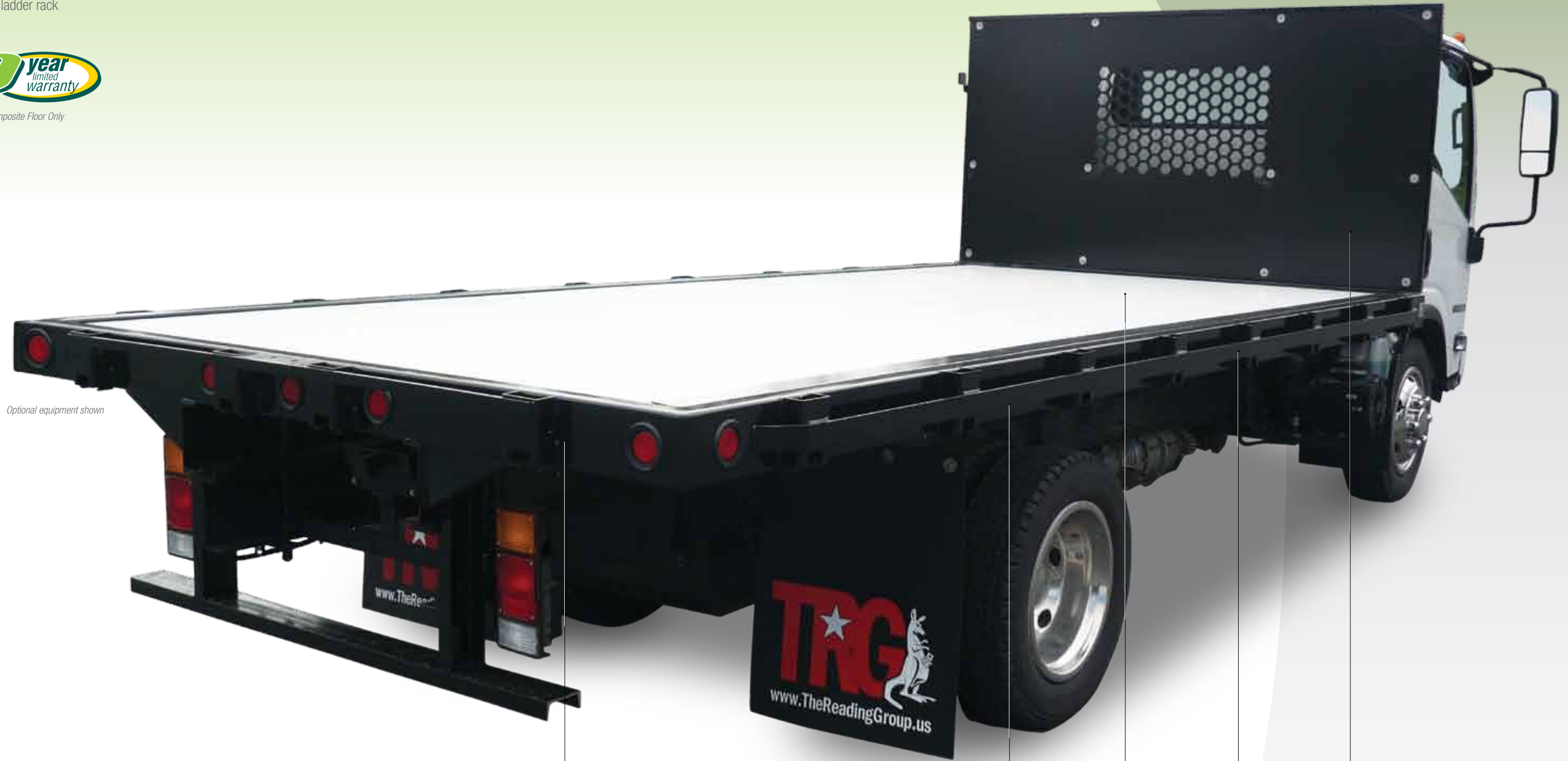
Optional equipment shown