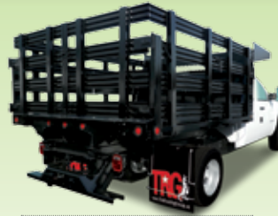
Steel Stake and Platform Bodies