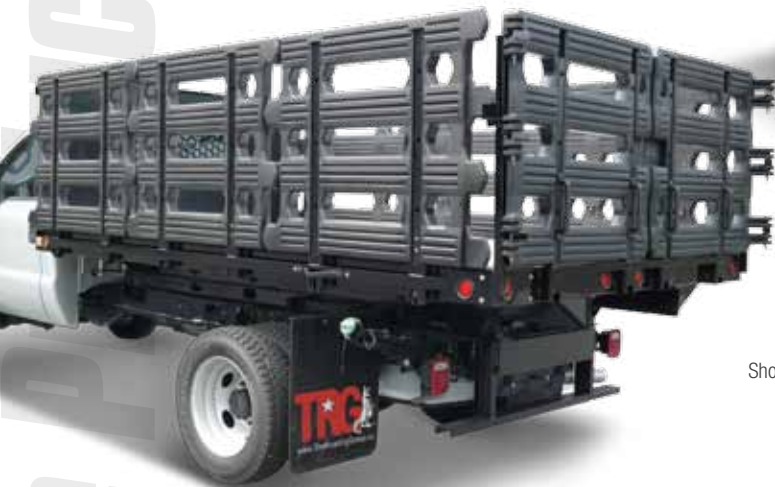
S.M.A.R.T. Racks and Tuff Skin