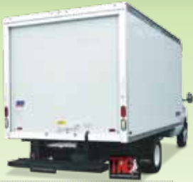
Cut-Away Van Bodies